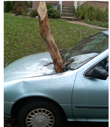
(using a Blackberry, hmmm) on a windy day while riding through Vienna, VA.